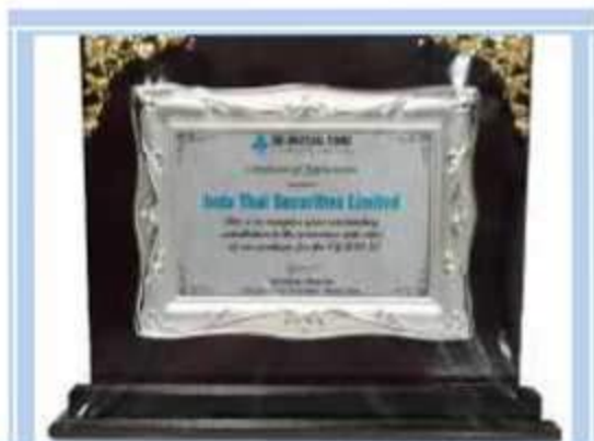
Certificate for outstanding contribution in the promotion & sales of SBI Mutual Funds product for FY 2021-22