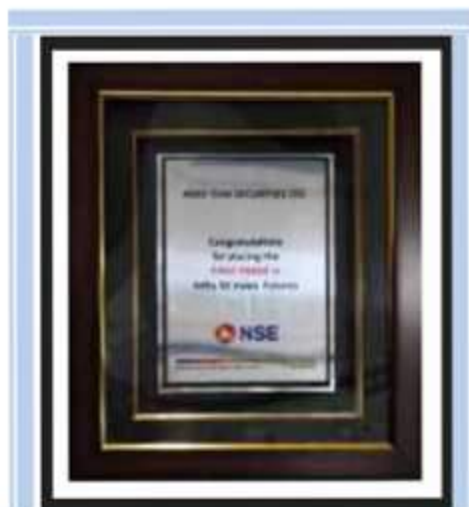
Certificate for for placing the 'First trade' in Nifty 50 Index Futures