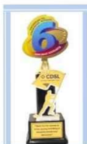
Award for the long journey & wonderful partnership with CDSL