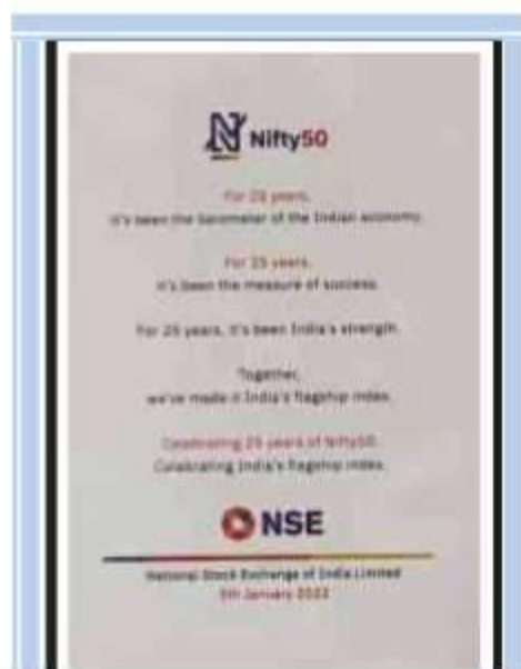
Certificate for celebration of 25 years of India's flagship index - Nifty50