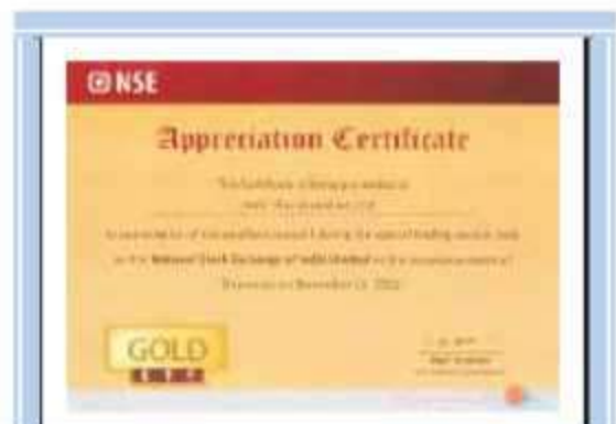
Certificate in appreciation of the excellent support during the special trading session held by NSE on the auspicious event of Dhanteras on Nov 11, 2012