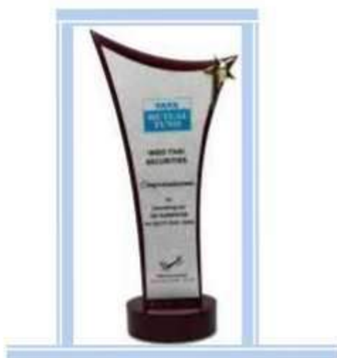
Award for becoming a SIP Superstar in Tata Mutual Funds for Q2 FY 2021-22