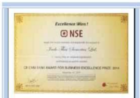
Certificate for the support by the company in making NSE an excellent organisation & helping win CII-EXIM Bank Award for Business Excellence Prize : 2014