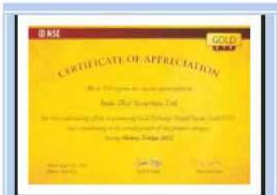
Certificate for outstanding efforts in promoting Gold Exchange Traded Funds (Gold ETF) during Akshay Tritiya 2012