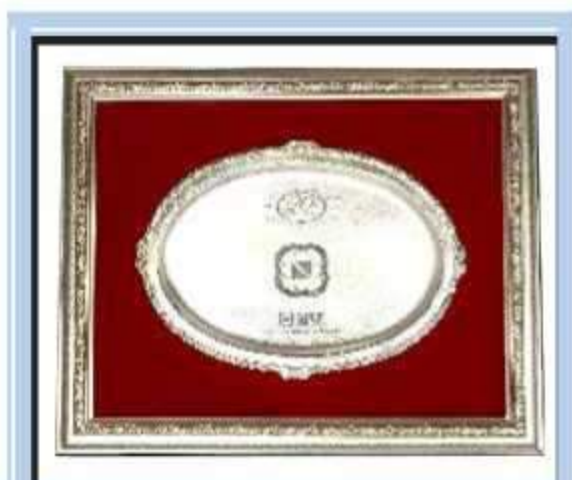
Certificate of achievement from NSE