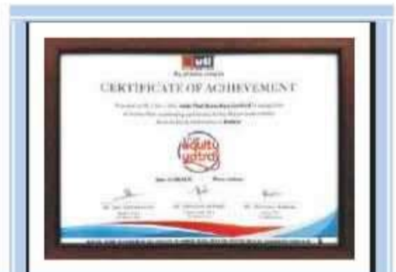
Certificate in recognition of the company's outstanding contribution to the Mutual Fund industry towards Equity Mobilisation in Indore