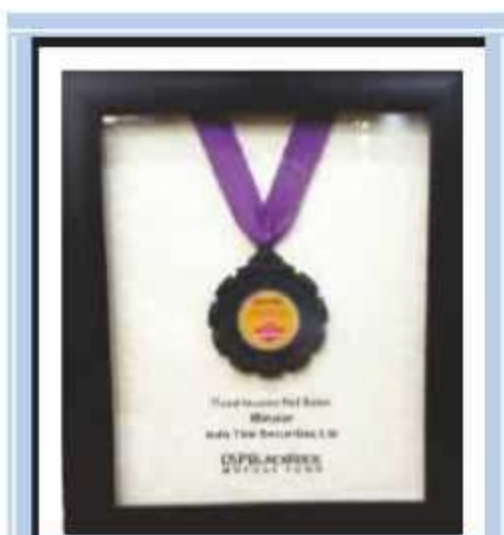
Certificate for making NIFTY 50 Index derivative contracts the 'world's largest traded index' in 2015