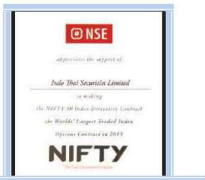
Certificate for making NIFTY 50 Index derivative contracts the 'world's largest traded index' in 2015