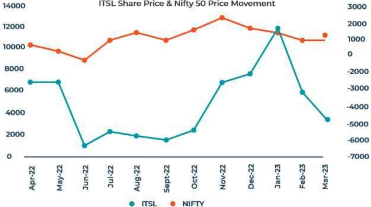
ITSL Share Price & Nifty 50 Price Movement

The monthly closing prices of the NIFTY and the company's equity shares have been indexed to 100 as on 1 st April, 2022.