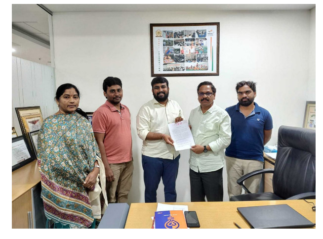
( Inking a key milestone with Ramky Foundation)