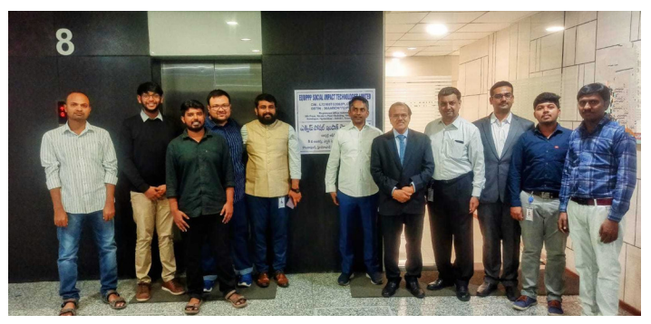
( Our team at Registered Office with Chairman )