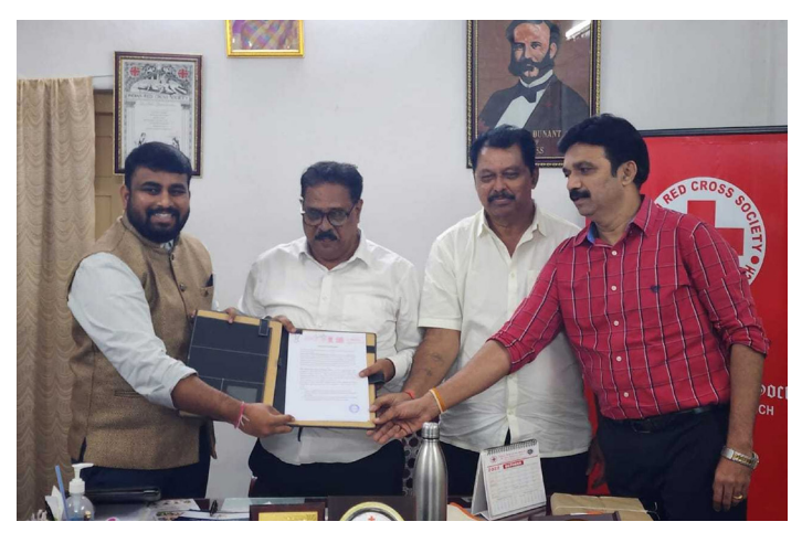
( Inking a key milestone with Indian Red Cross Society, Telangana State )