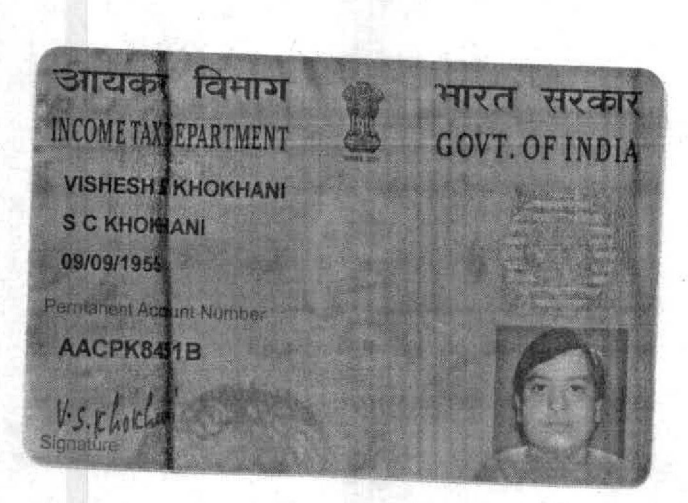
V.S. (Cho (Chum;