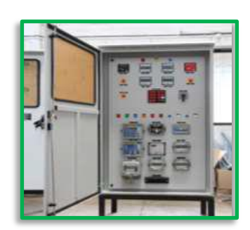
Control and Relay Panels