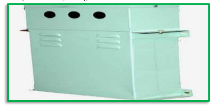
LT (APP) capacitor of non-standard voltages like 480 V/525 V and any other special voltages