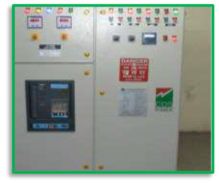
LT APFC (Automatic Power Factor Control) panels with contactor-based switching