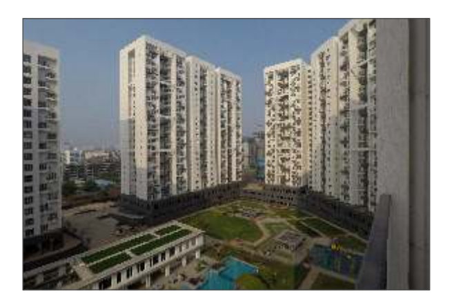
Godrej Infinity, Pune 1.30 million sq.ft.