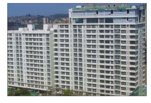
The Trees Phase - 3, Vikhroli 0.35 million sq.ft.