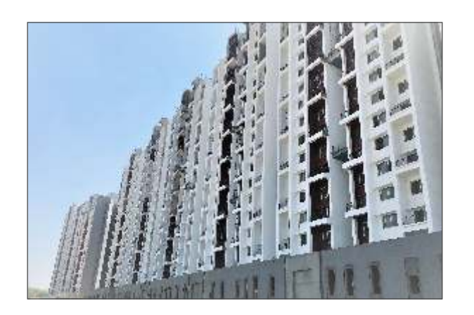
Godrej 24, Pune 0.95 million sq.ft.