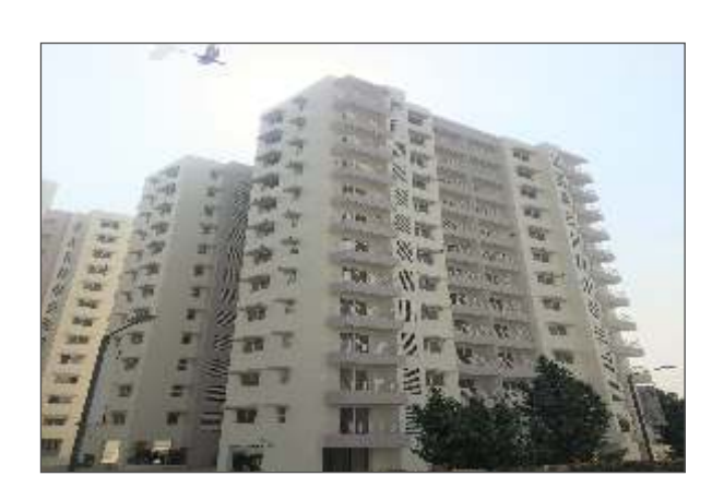
Godrej Garden City, Ahmedabad 0.15 million sq.ft.