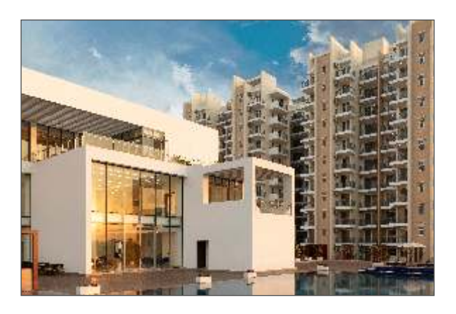
Godrej Aria, NCR 0.67 million sq.ft.