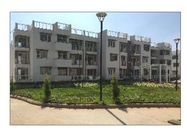
Godrej Eternity, Bangalore 0.40 million sq.ft.