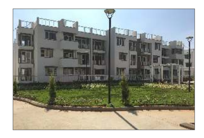
Godrej Eternity, Bangalore 0.18 million sq.ft.