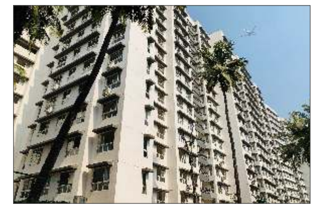
Godrej Prime, Mumbai 0.75 million sq.ft.