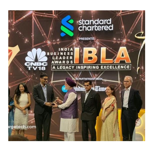
The Disruptor - India Business Leader Award | CNBC-TV18