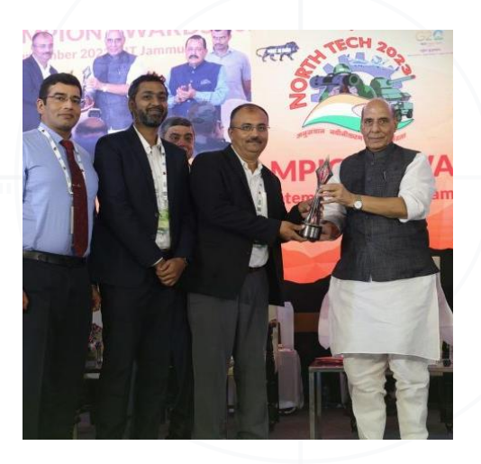
SIDM Champion 'Technology and Product Innovation' category