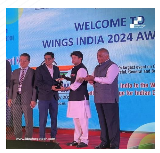
Best Aviation Startup of the Year | Wings India (FICCI)