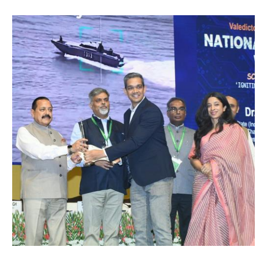
National Technology Award | Dept. of Science & Technology