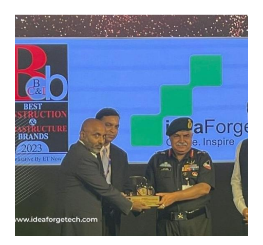
Best Brand in the Construction & Infrastructure Industry for Innovative Technology | ET Now