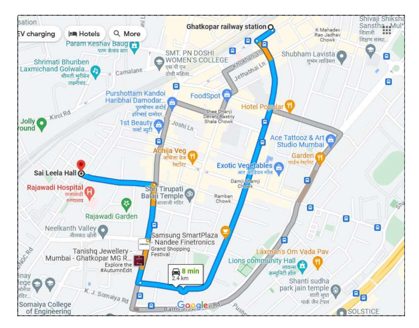
Nearest Landmark : RN Gandhi Road