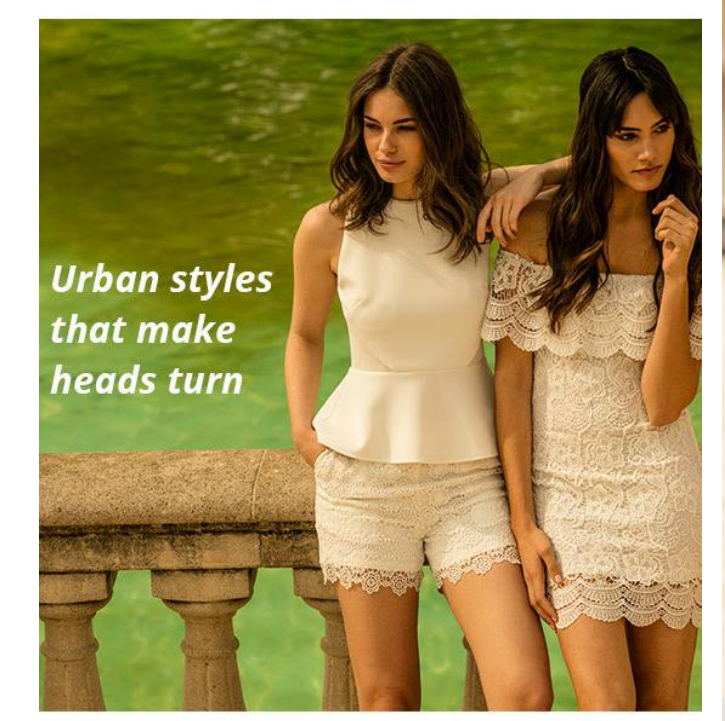
Discover international fashion #WearYourStory