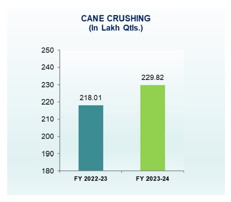
9 Months ended