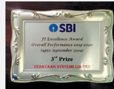
FI Excellence Award Overall Performance 2019-2020