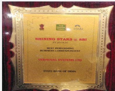
Rewarded by DFS for Best Performing BC 2019-20 (Shining Star Campaign FY 2019-2020)