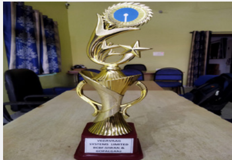
Best BC Performance Award in SSS from Siwan RBO to VEDAVAAG SYSTEMS LTD.