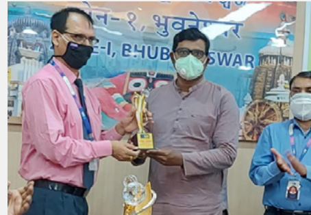
Best BC performance Awarded by DGM, SBI Zone 1 Bhubaneswar