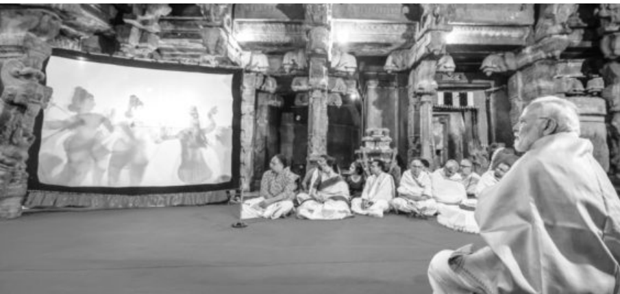
श्री सत्य साईं जिले के वीरभद्र मंदिर में प्रधानमंत्री नरेंद्र मोदी

मोदी ने कहा, ‘पिछले 10 वर्षों के दौरान कर प्रणाली में कई सुधार लाए गए। पहले अलग-अलग कर प्रणाली हुआ करती थीं जिन्हें आम नागरिकों के लिए समझना मुश्किल होता था। अब रिकॉर्ड स्तर पर कर राजस्व मिल रहा है और भ्रष्टाचार के खिलाफ कार्रवाई की जा रही है। इसके अलावा 10 करोड़ फर्जी लाभार्थी