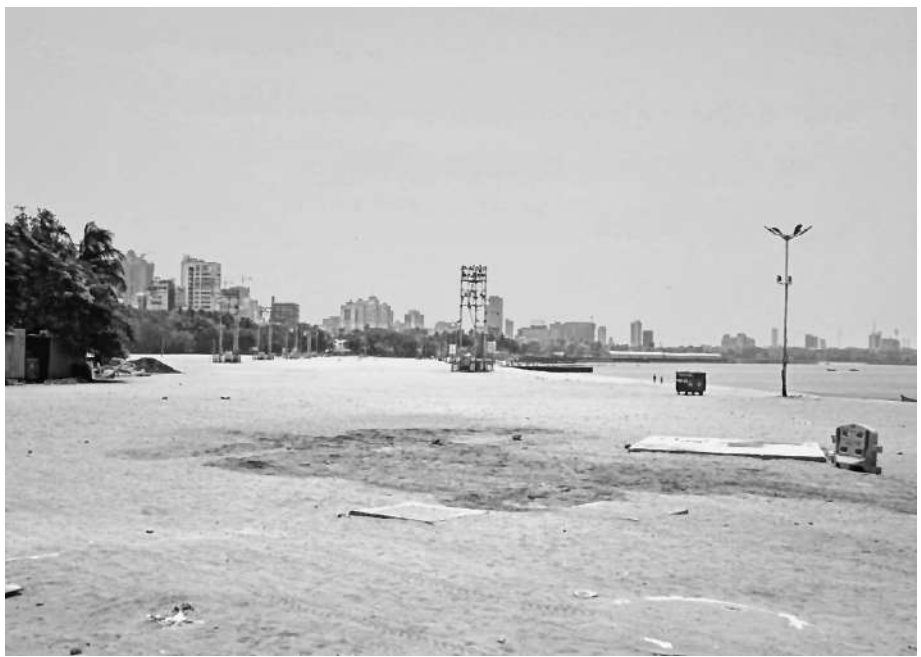
Usually crowded with revellers, Girgaon Chowpaty wore a deserted look as intense heat kept visitors at bay on Monday