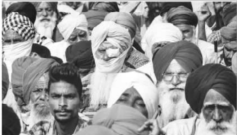
The Saamana editorial praised protesting farmers of Punjab, saying they deserve fame and glory. On Parkash Singh Badal returning Padma Vibhushan, Sena wrote in Saamana.

Mumbai. Extending support to farmers' protest against new farm laws, the Shiv Sena on Friday said the 'invincible' image of PM Narendra Modi and Home Minister Amit Shah has suffered a blow like never before. The Shiv Sena, in its mouthpiece Saamana, on Friday wrote, "Never seen the Modi government in so much trouble in the last six years. The misunderstanding that Prime Minister Narendra Modi and Home Minister Amit Shah can bend anyone has been proven false by farmers. Taking a dig at the BJP, Shiv Sena wrote in Saamana, "Even in this cold weather, farmers of Punjab have forced the Modi government to sweat. Campaigns were launched to defame the farmers' movement but tables instead turned on T cell of the BJP." Saying the farmers' protest has put immense pressure on the Narendra Modi-led government, Saamana editorial said, "Usual weapons of government, CBI, Income Tax, ED, etc. can do anything here. In fact, farmers of Punjab have sent a notice to the Modi government to 'move back or leave the chair'. The farmers have brought the central government to its knees, the Sena said.