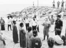
It has issued yellow alerts for the districts of Thiruvananthapuram, Kollam, Pathanamthitta, Alappuzha, Kottayam, Ernakulam, Idukki, Thrissur, Palakkad and Malappuram.

Thiruvananthapuram The Met department has withdrawn the red alert issued for cyclone Burevi and rains in the seven southernmost districts of the state as the deep depression was likely to weaken further into a depression. The India Meteorological Department (IMD) in a late-night bulletin issued on Thursday withdrawn the red alert and issued a yellow alert for 10 districts of the state.