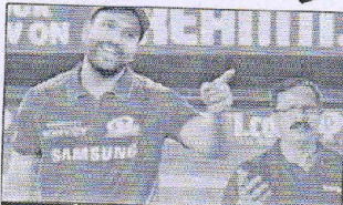
बचपन के दोस्त लाडले ने बड़ा राज की बात