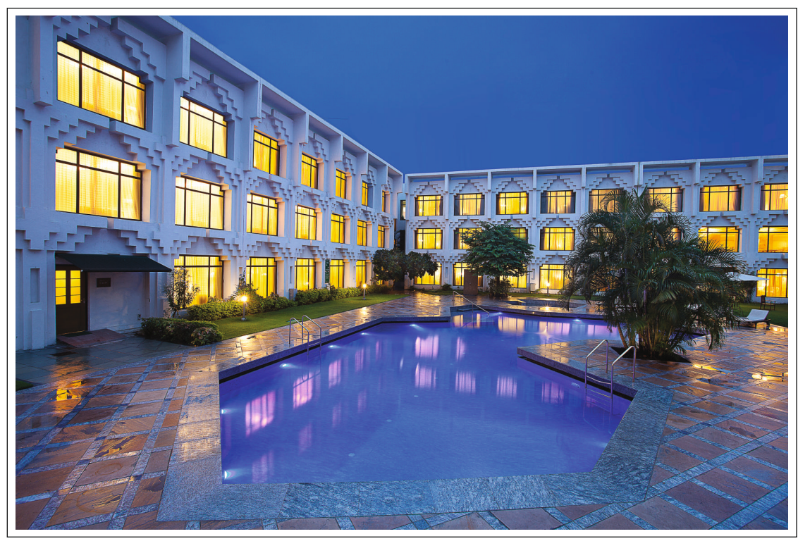
Pool Side View