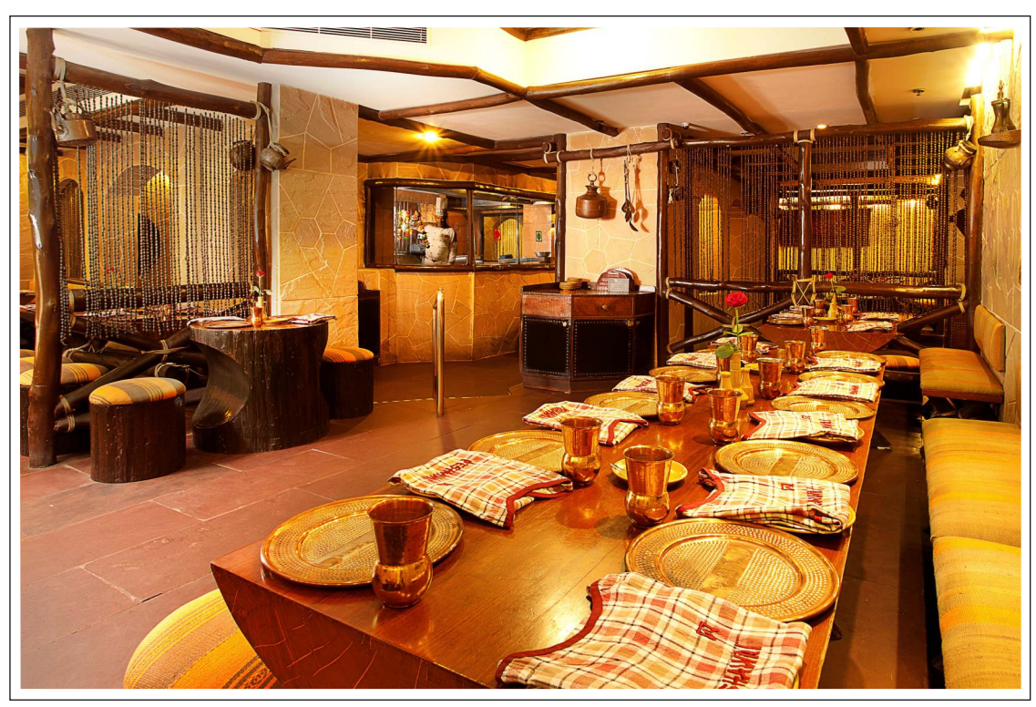
Peshawri - Speciality restaurant offering North-West Frontier cuisine