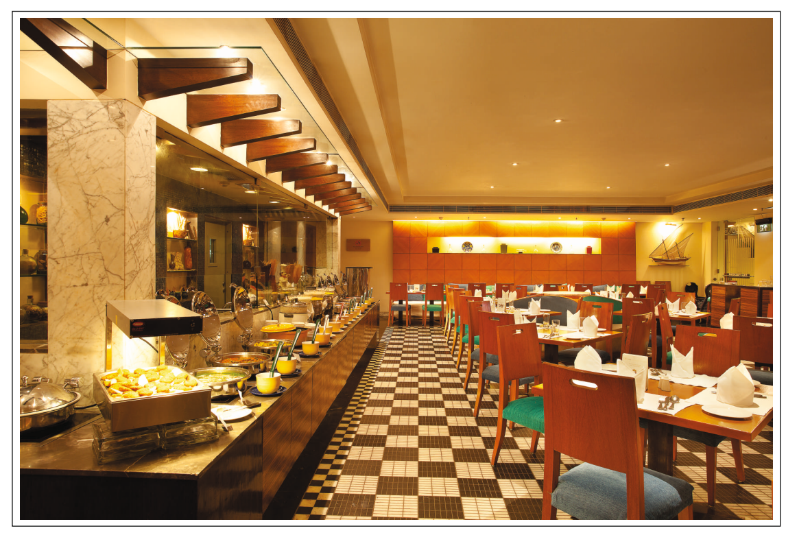
Welcomcafe Cambay 24x7 Fine Dining restaurant