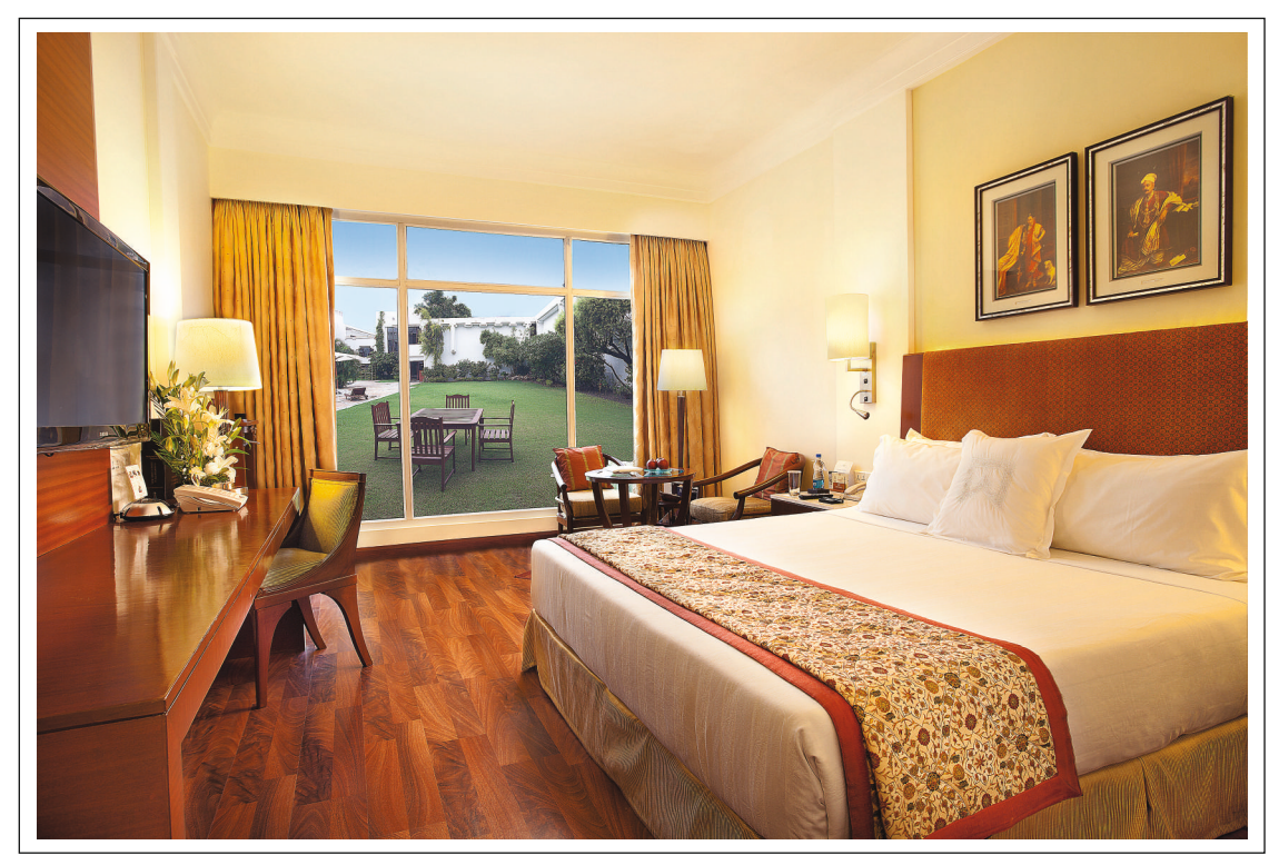
Executive Club Exclusive room