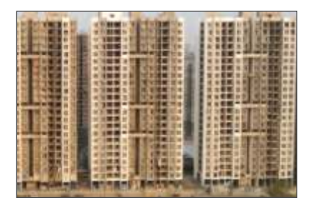
Godrej Park Greens, Pune 0.51 million sq. ft. GPL Economic Interest: DM- 6.6% of Revenue & Profit Share – 44%