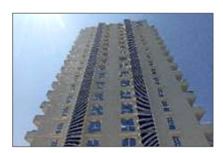
Godrej Air NXT, Bengaluru 0.16 million sq. ft. GPL Economic Interest: 50% profit share