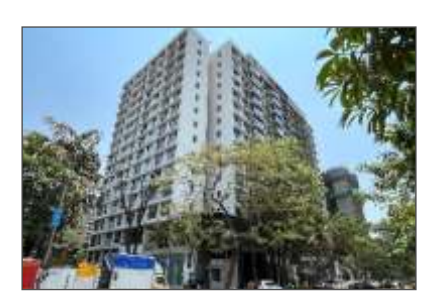
Godrej Urban Park, MMR 0.23 million sq. ft. GPL Economic Interest: 100% Owned