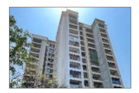
Godrej R K Studio, MMR 0.34 million sq. ft. GPL Economic Interest: 100% Owned