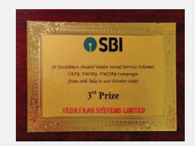
Excellence Award for PMJJBY-PMSBY- 2019