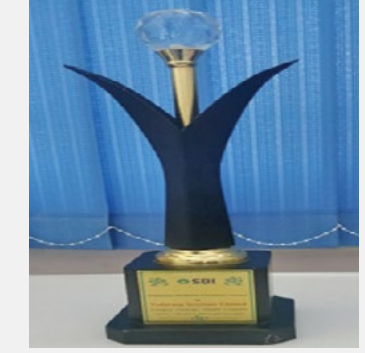
Excellence Award for PMJJBY-PMSBY- 2019