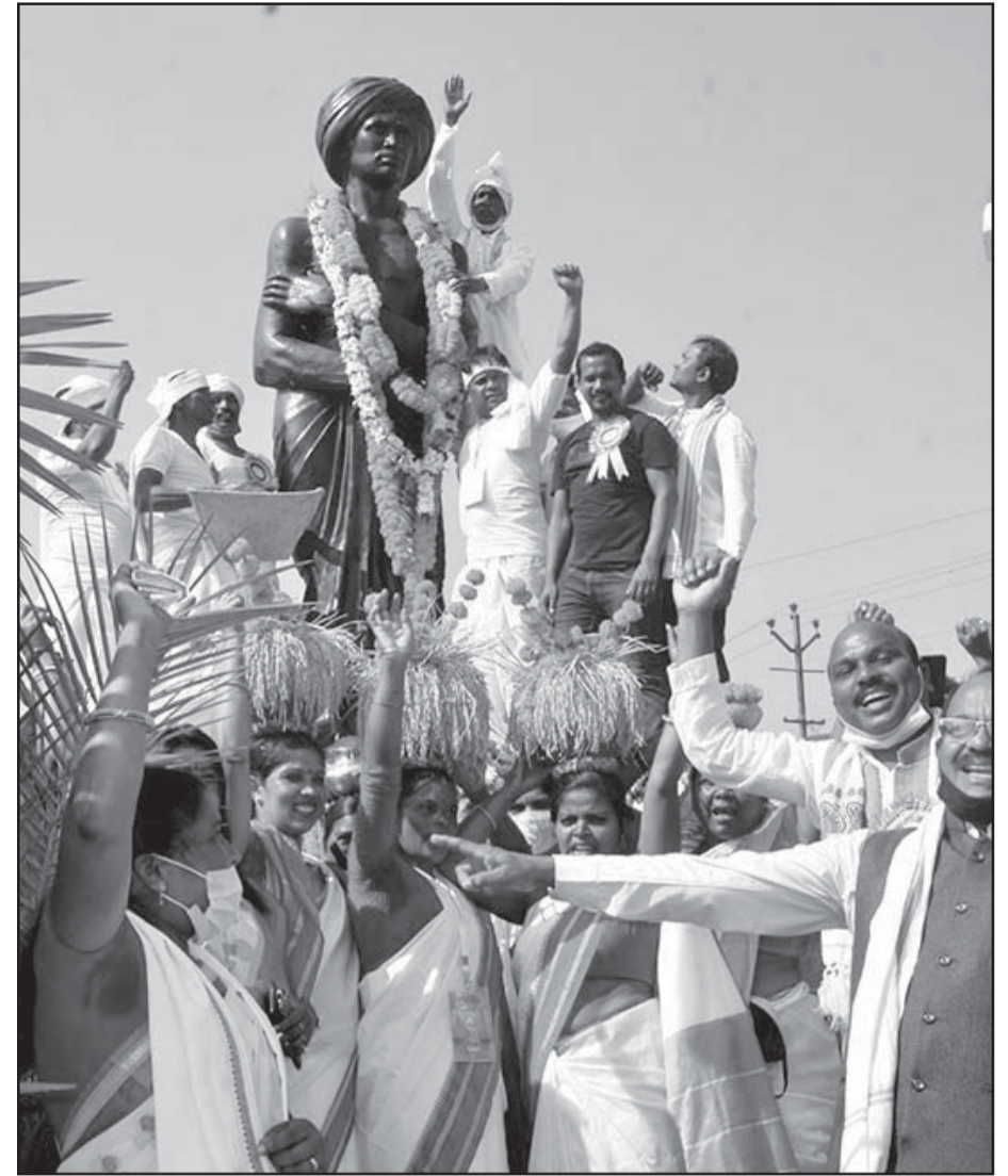
Tribal community members perform rituals after paying floral homage to the statue of Jharkhand founder Birsu Munda on his birth anniversary and 20th foundation day of the state at Kokar area, in Ranchi.

Meanwhile, Union Minister Rajnath Singh and BJP leader Sushil Kumar Modi also reached the Governor's House to meet Chauhan.