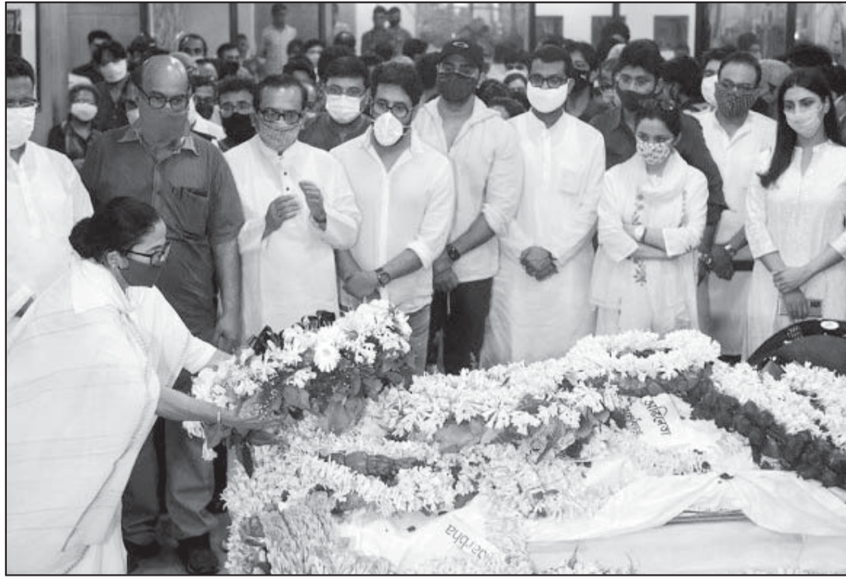
West Bengal Chief Minister Mamata Banerjee pays her last respects to iconic Bengali actor Soumitra Chatterjee, who died today after an over-a-month-long battle with multiple ailments, during his funeral in Kolkata on Sunday.