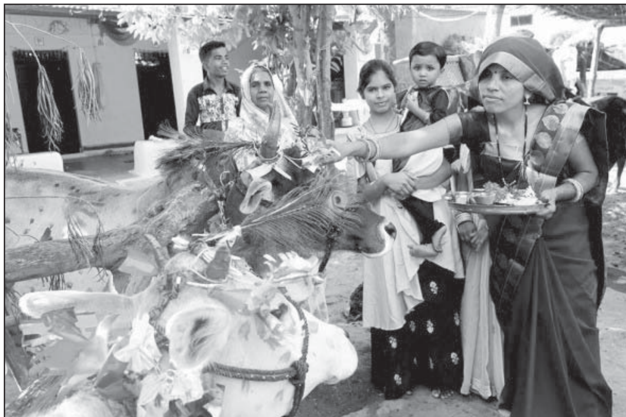
Women worship cows on the occasion of 'Govardhan Puja' festival, in Bhopal on Sunday.

"Incense sticks are already being made from flowers at the Sai temple in Shirdi and Vaishno Devi shrine. Soon, we will be also making incense sticks with flowers at the Chandrika Devi temple in Lucknow," he said.