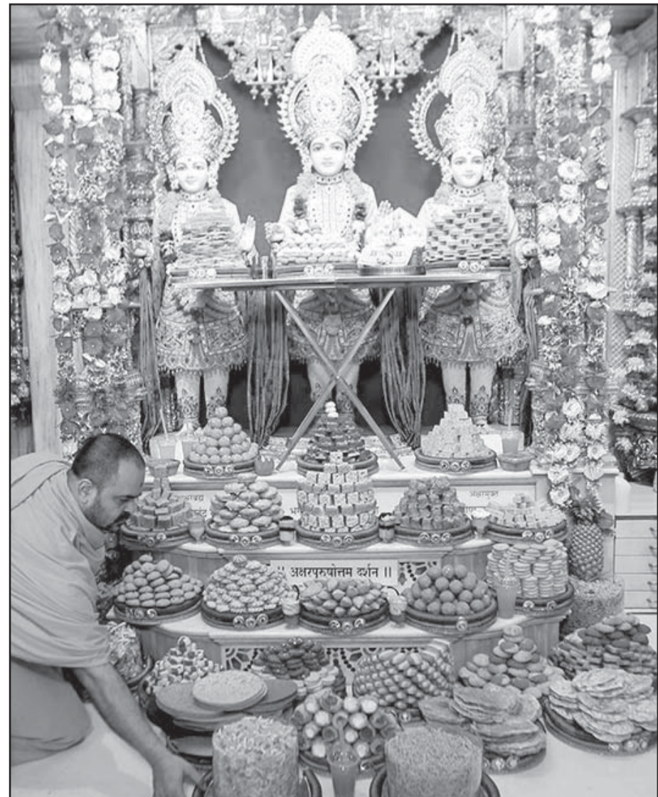
A Swaminarayan Saint arranges sweets kept inside a temple as offerings by Hindu devotees to mark 'Annakut' festival during 'Diwali', in Ahmedabad on Sunday.