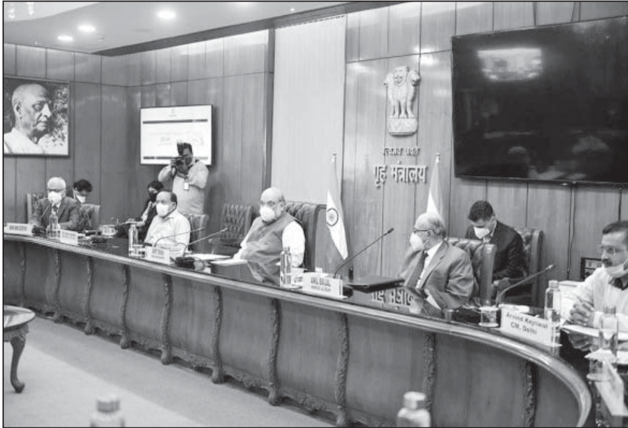
Home Minister Amit Shah chairs a meeting over the Covid-19 situation in the national capital with Delhi Chief Minister Arvind Kejriwal, LG Anil Baijal, Union Health Minister Harsh Vardh and Delhi Police commissioner, Director of AIIMS Randeep Guleria, in New Delhi on Sunday.

"Happy to note that India has added two more Ramsar sites. Lonar lake in Maharashtra, the only crater lake of the country, and Sur Sarovar, also known as Keetham lake in Agra. Wetlands are the world's natural water filters and one of the most productive ecosystems on the planet," Javadekar tweeted.