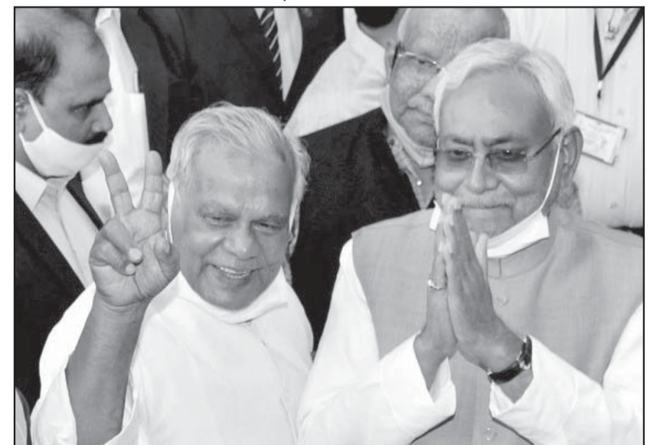
JD(U) National President Nitish Kumar and HAM(S) Chief Jitan Ram Manjhi after meeting Bihar Governor Fagu Chauhan in Patna on Sunday.

Sushil Kumar Modi proposed the name of Prasad as the party's legislature party leader which was seconded by all the newly-elected MLAs.