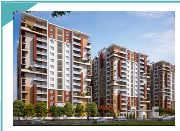
Vasavi Lake City, Hafeezpet