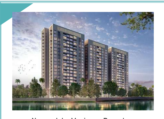
Newyork by Manjeera, Bangalore