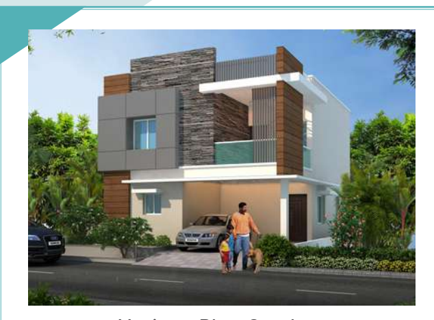
Manjeera Blue, Ongole