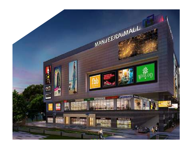
Manjeera Mall, Rajahmundry