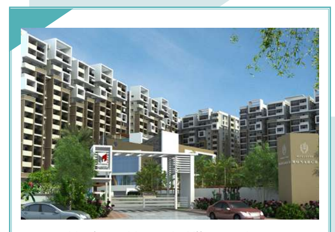
Manjeera Monarch, Vijayawada