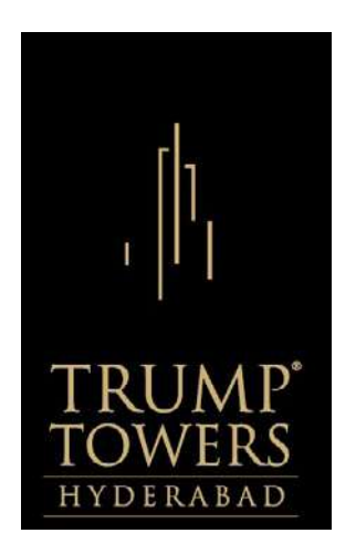
Trump Towers, Hyderabad