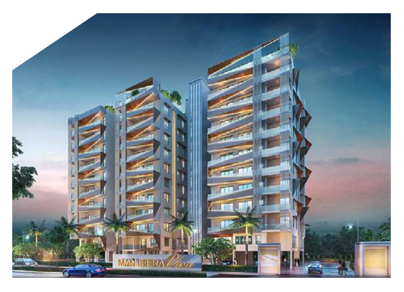
Manjeera Casa, Hyderabad