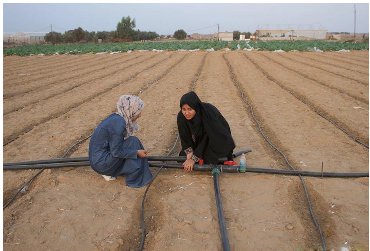
Palestinian women work on a farm near the border between the Gaza Strip and Israel, east of the southern Gaza Strip city of Khan Younis.