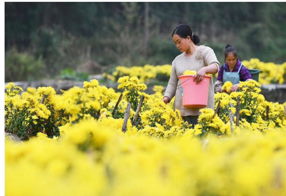
Villagers pluck chrysanthemum flowers in Jinxi Village of Xima Township, Longli County of southwest China's Guizhou