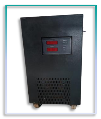
Battery and Battery Chargers