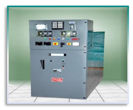
Indoor MV Switchgears up to 33 kV