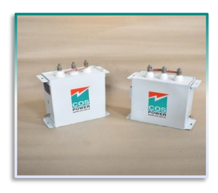
LT (APP) capacitor of non-standard voltages like 480 V/525 V and any other special voltages