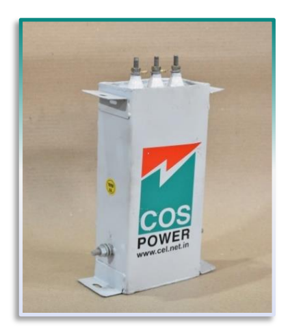
LT (APP type) capacitors for standard 415/440 V

Our Company manufactures capacitors, switchgears, harmonic filters, cable termination kits, transformers, battery and battery chargers, electrical panels etc.