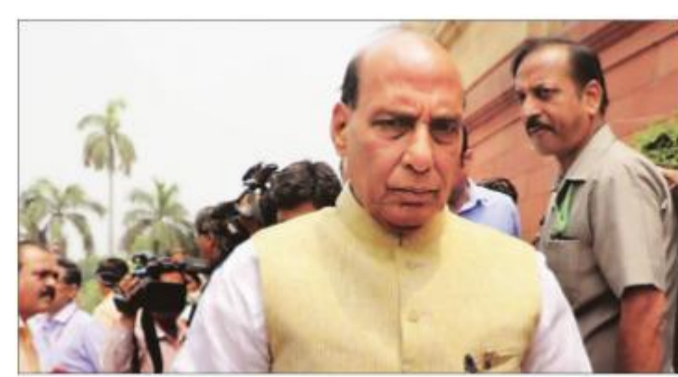
PRESS TRUST OF INDIA New Delhi, July 16

DEFENCE MINISTER RAJNATH Singh on Friday met Congress leader AK Antony and NCP chief Sharad Pawar and is learnt to have briefed them about the border row with China in eastern Ladakh as well as the current situation in the region, people familiar with the development said. The former defence ministers were also provided with some details about India's military preparedness in the region during the meeting, which was also attended by Chief of Defence Staff Gen Bipin Rawat and Army Chief Gen MM Naravane, they said. The meeting is seen as an effort by Singh to reach out to the Opposition ahead of the Monsoon session of Parliament beginning July 19. Earlier in the day, Leader of House in Rajya Sabha Piyush Goyal also met opposition leaders, including Pawar and former PM Manmohan Singh Congress has already indicated that it will raise the border row with China in Parliament