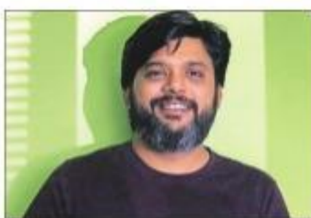
I shoot for the common man: Danish Siddiqui

band and father, and a much-loved colleague. Our thoughts are with his family at this terrible time."