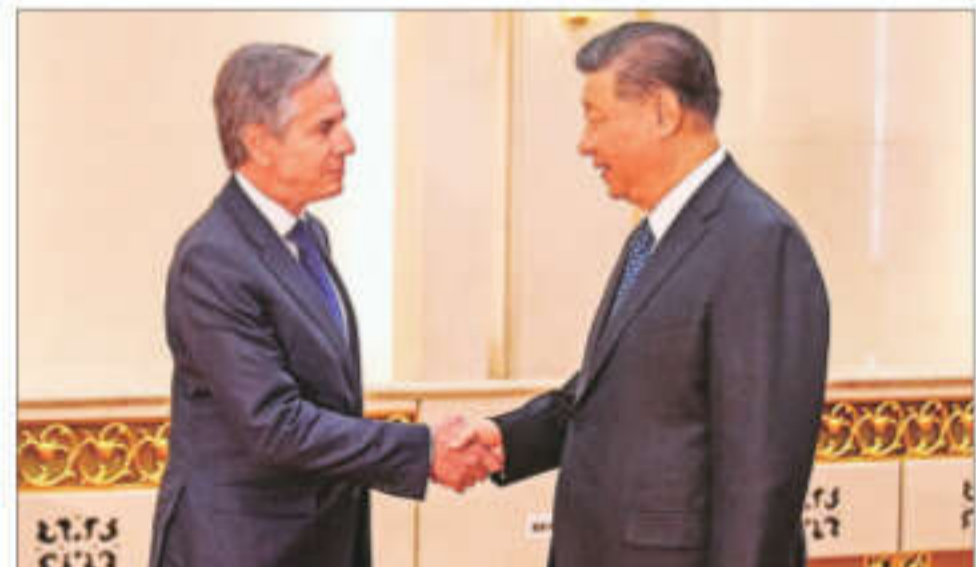
US secretary of state Antony Blinken meets Chinese president Xi Jinping during his state visit to China on Friday.