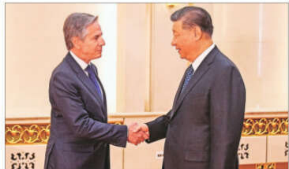
US secretary of state Antony Blinken meets Chinese president Xi Jinping during his state visit to China on Friday.