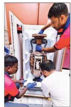
Expert art handlers transporting international art objects at CSMVS

Beyond the tangible and financial, what is also at stake is reputation—both of the institution and the country, notes Sah. "When entrusted with safeguarding someone else's valuable possessions, it goes beyond a transaction. A mishap doesn't just affect the institution, it impacts the country's image and can quickly escalate into national concerns."