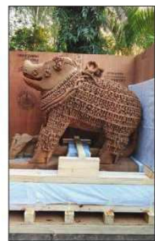
Expert art handlers transporting international art objects at CSMVS