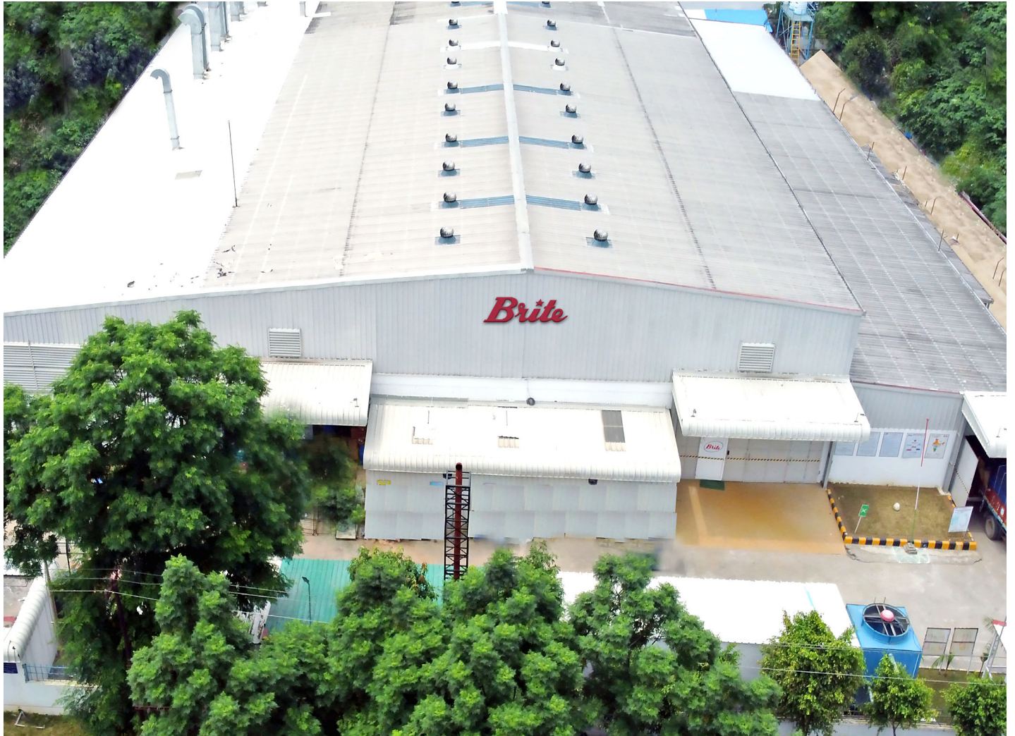
New manufacturing unit at SIDCUL, Haridwar