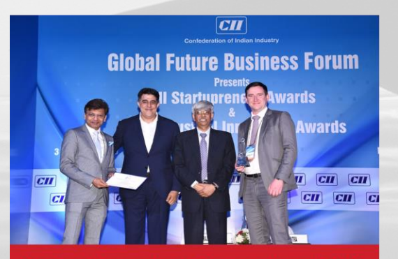
Received Innovator of the year Award 2018 in the Medium Enterprise Category by CII