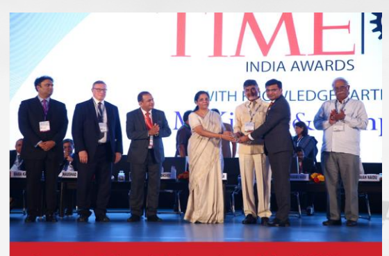
Received Special Jury Award for MSMEs in the 2017 TIME India Awards