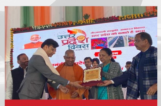
PTC honoured by UP Government for Ushering a positive change in the state