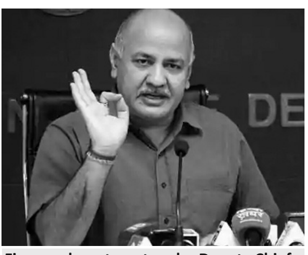
Finance department under Deputy Chief Minister Manish Sisodia has decided to give a mega festive package to Delhi government employees in view of the hardships due to the COVID-19 pandemic and the lockdown, an official statement said

New Delhi The Delhi government on Thursday announced that its employees can take cash equivalent of leave travel concession (LTC) if they opt for it, a move aimed at boosting consumer spending during the festive season. It said a special festival package of advance will be also be accorded to all Delhi government employees for any important festivals up to March 31, 2021.