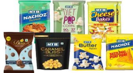
2. Ready to Eat - Western (Rs. 28,500 crore)