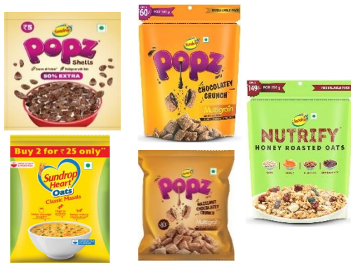
4. Breakfast Cereals (Rs. 3500 crore)