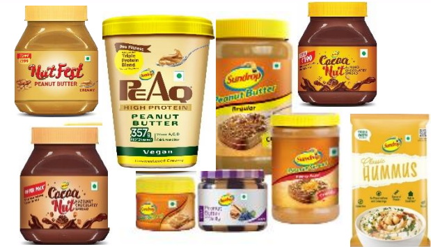
3. Spreads (Rs. 3400 crore)