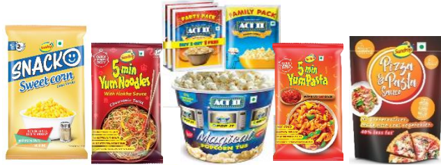
1. Ready to Cook (Rs. 18,000 crore)