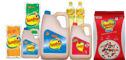
6. Staples (N.A.)