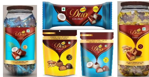
5. Chocolate Confectionery (Rs.13,600 crore)