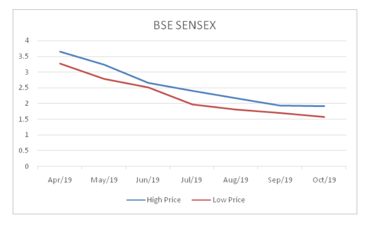
Post effective date of suspension, the shares were traded on every Monday of week from April 2019 to till October 29, 2019 and thereafter no securities of Company were traded.

I. Performance of PVP Ventures Limited monthly closing prices in comparison to monthly BSE Sensex closing