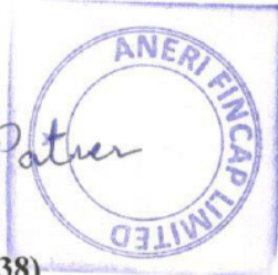
Pintu Patra (DIN: 02782738)