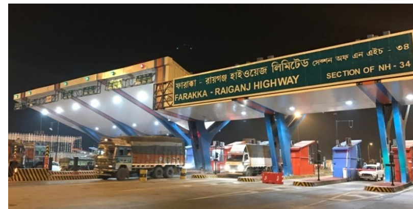
Farakka Raiganj Highway: Toll Plaza at Km 297