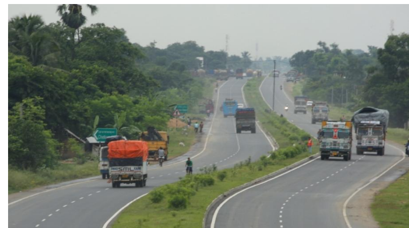
Km 341 (Farakka Raiganj Highway)