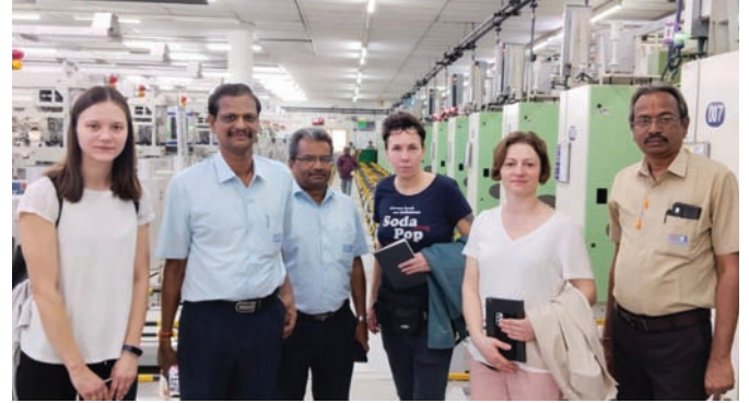
Our Executives with Export Customers from Poland during their visit to Rajapalayam Mills.