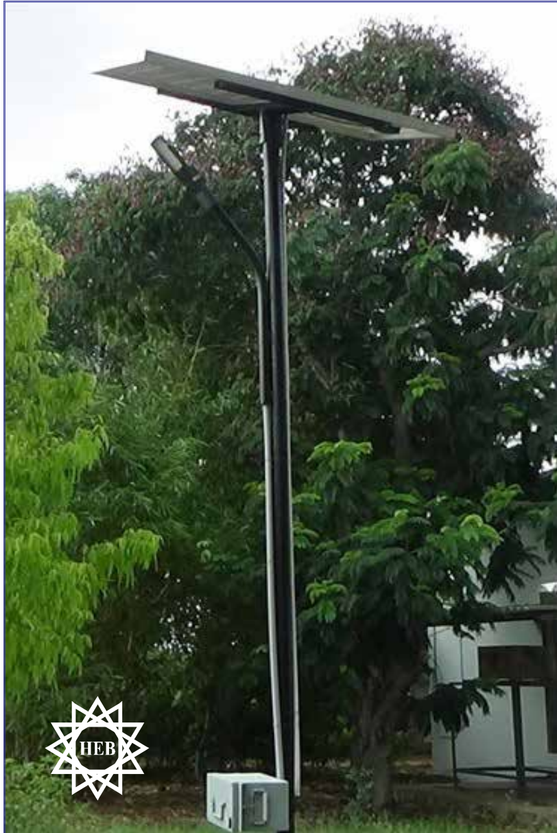
Standalone Solar PV Lighting using Second Life Lithium Ion Battery