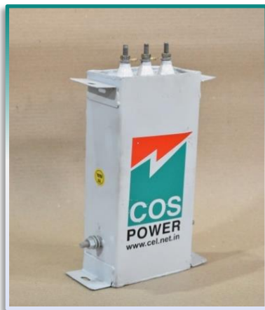
LT (APP type) capacitors for standard 415/440 V

Our Company manufactures capacitors, switchgears, harmonic filters, cable termination kits, transformers, battery and battery chargers, electrical panels etc.