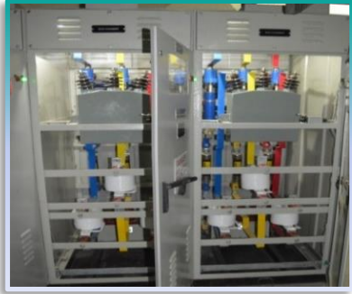
LT APFC (Automatic Power Factor Control) panels with contactor based switching