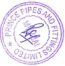
Table II - Statement showing shareholding pattern of the Promoter and Promoter Group