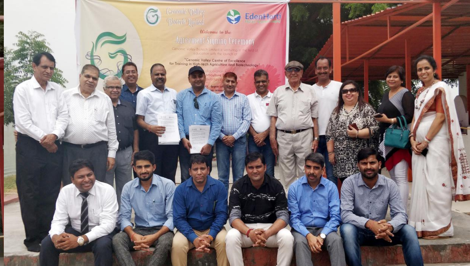
venture in Hi-tech Agriculture & Biotechnology Education