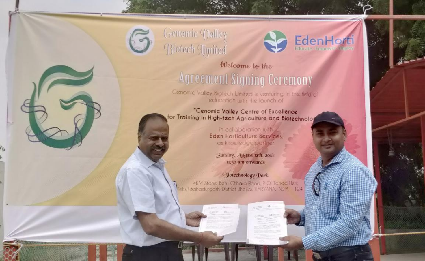
GVBL collaborates with Eden Horticulture for our future