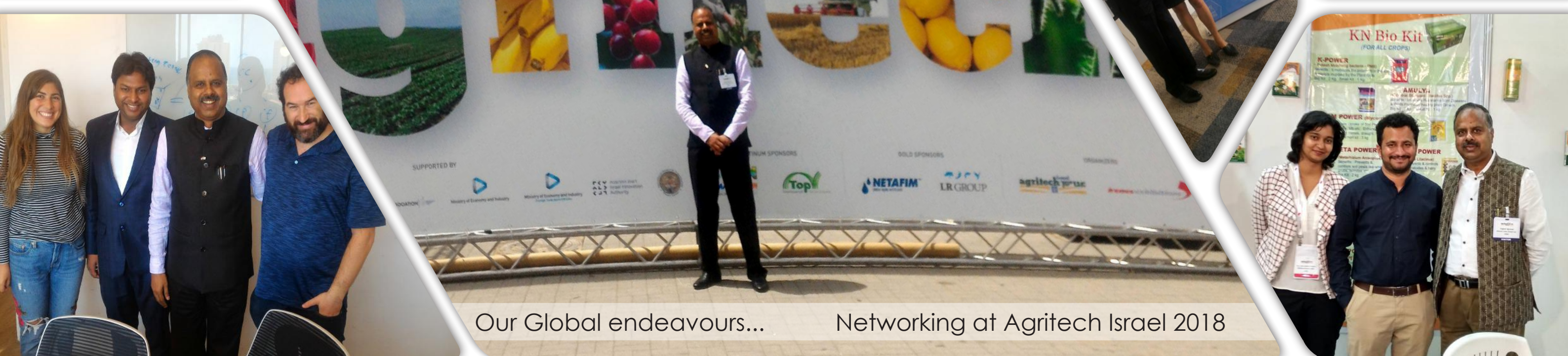
Our Global endeavours...