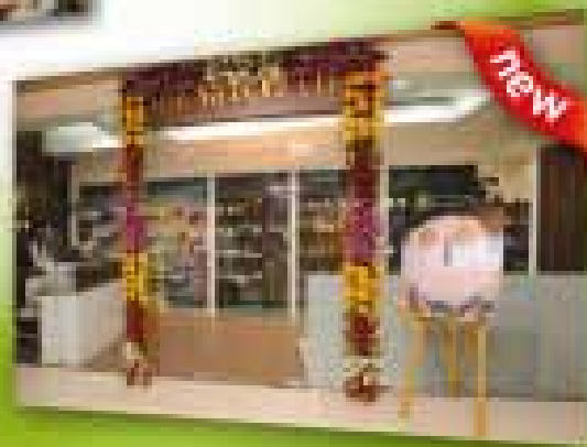
ISCON mall AHMEDABAD