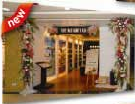
Express Avenue CHENNAI