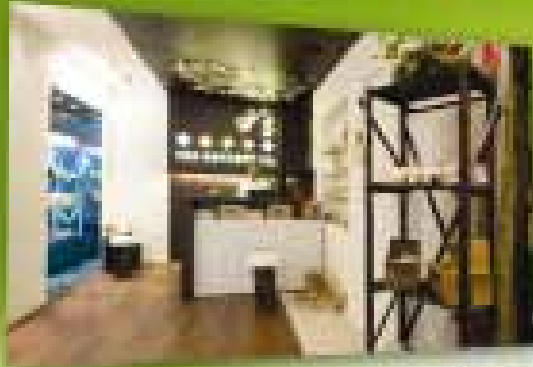
Select CITYWALK DELHI