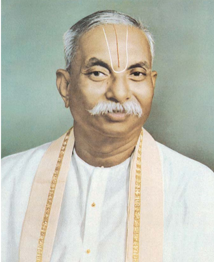
SHRI P.A.C. RAMASAMY RAJA