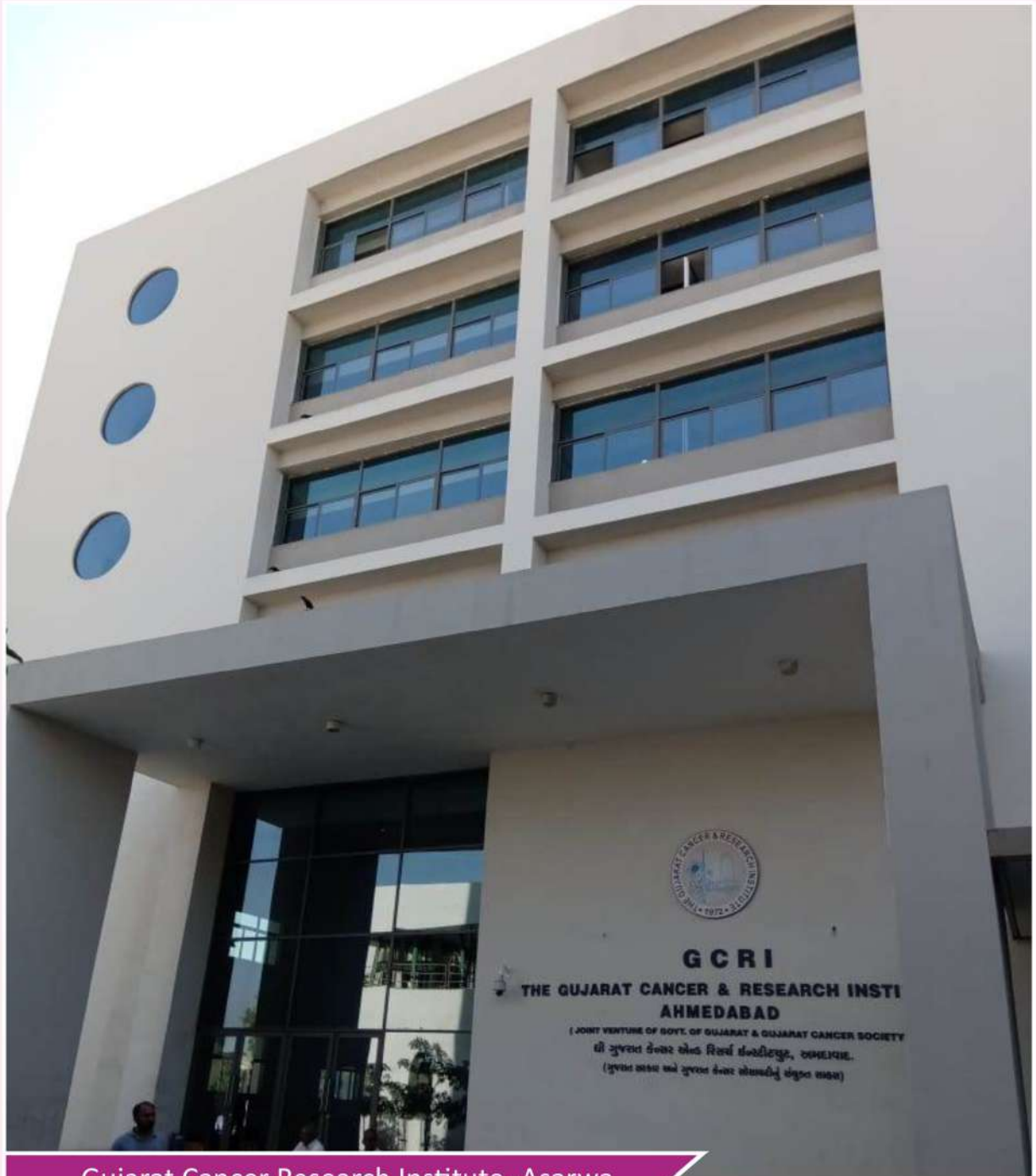
Gujarat Cancer Research Institute -Asarwa