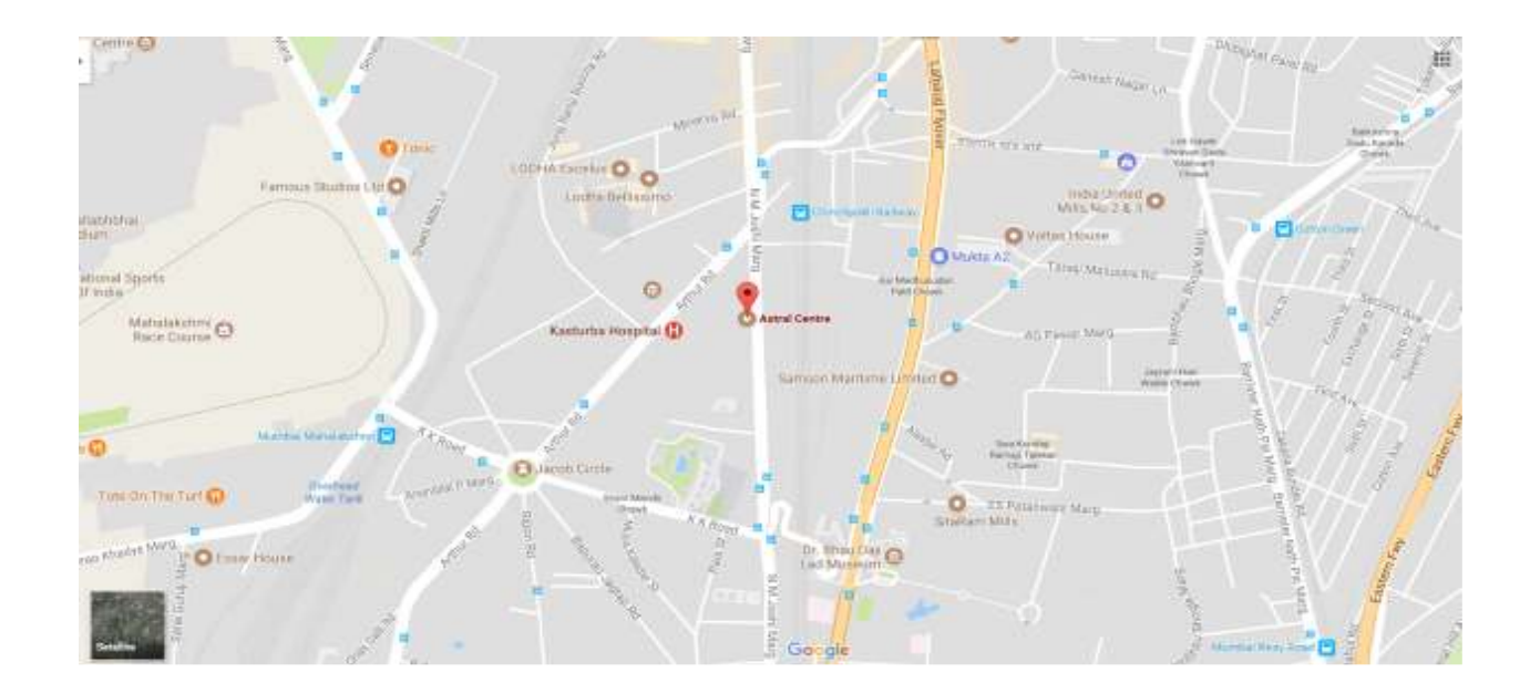
Distance from Chinchpokli Railway Station: 0.4 KM

Date & Time: 28<sup>th</sup> Sept 2018 at 11.00 am