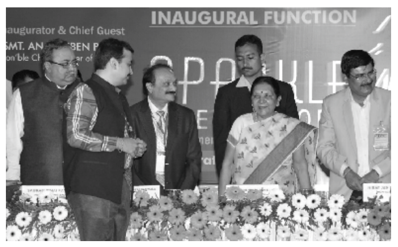
A GIS Portal lunched by Hon. Chief Minister Smt. Anandiben Patel, Gujarat state, which is Developed by Scanpoint Geomatics Ltd. for Surat Municipal Corporation.