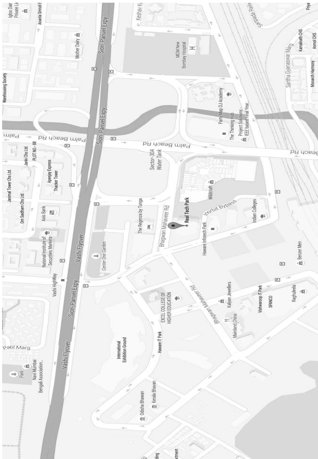
(MAP FOR LOCATION OF AGM VENUE)