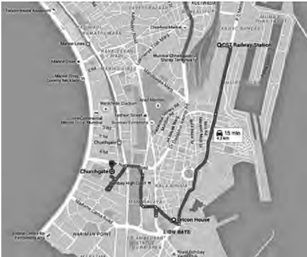
Route map from CST Station to Oricon House and from Churchgate to Oricon House