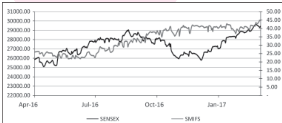
Share price comparison chart of Equity Shares of the Company vis-à-vis BSE Sensex