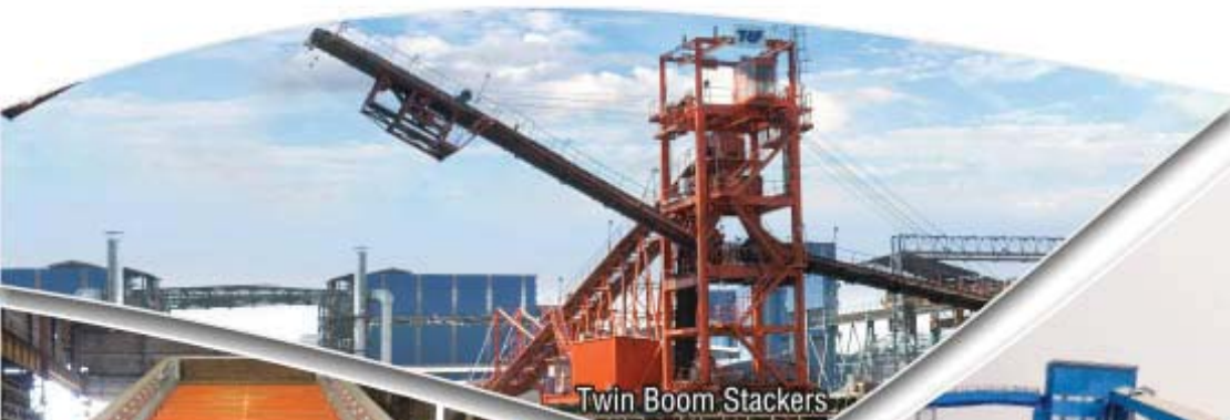
Twin Boom Stackers