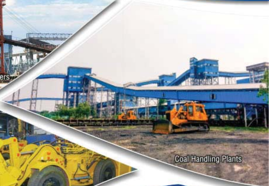
Coal Handling Plants