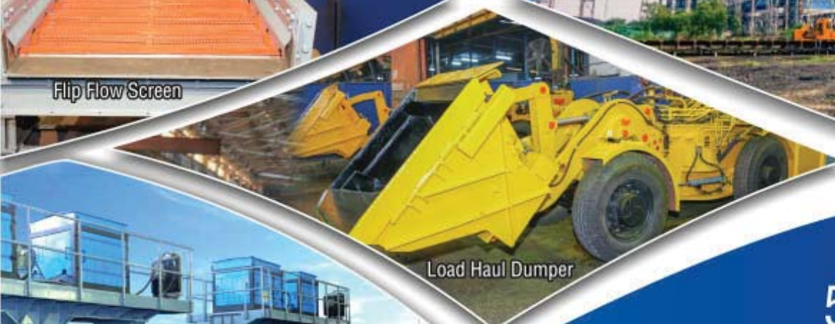
Load Haul Dumper