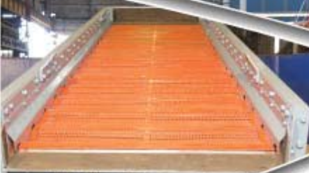
Flip Flow Screen