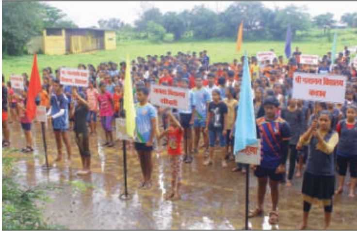
Talent Search Event-Varsha Krida Mohatsav July 2017