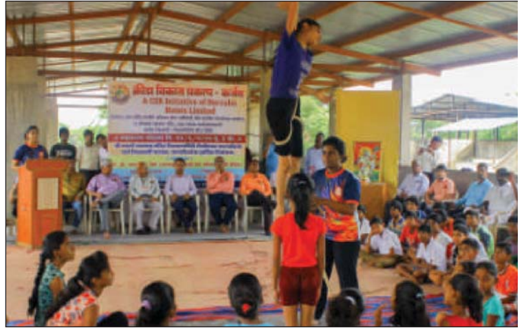
Energizing and Inauguration Krida Vikas Project