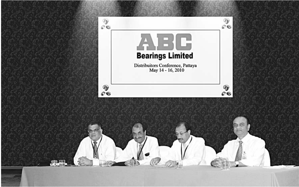
The Directors and CEO, during the 1 st ever outside India Distributors Conference 2010 in Pattaya, Thailand