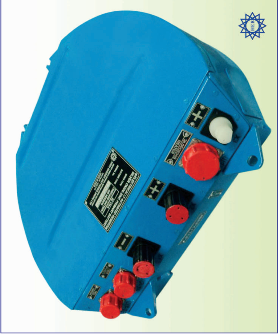
Primary Reserve Battery for Advanced Missile Application