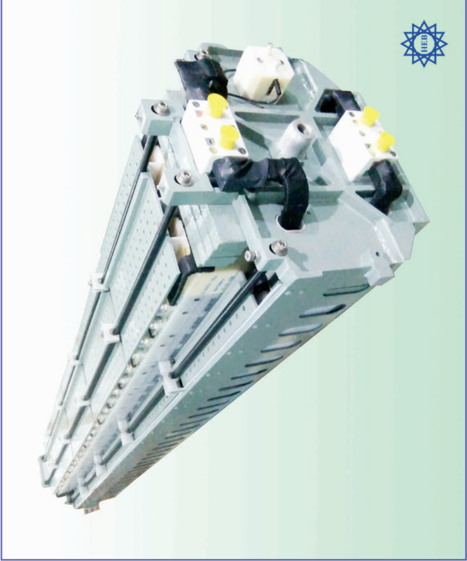
High Power Silver Zinc Battery for Underwater Application.