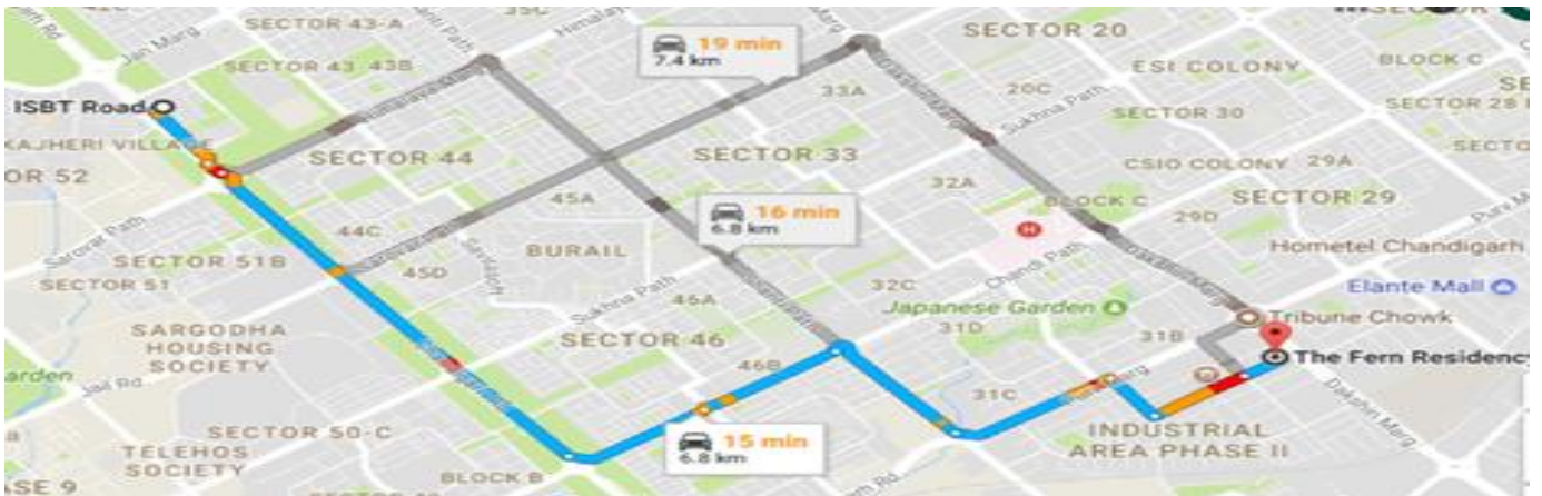
Distance from ISBT-43, Chandigarh 7.4 KM