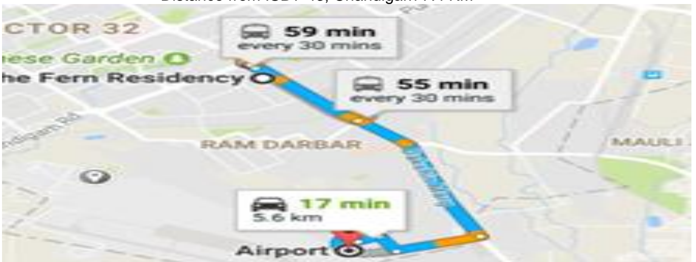
Distance from Chandigarh Airport, Bhelana, 5.6 KM