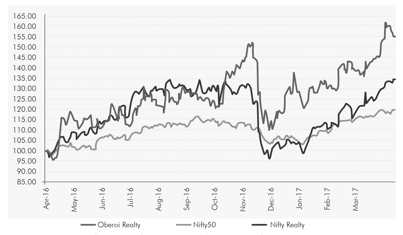
Closing value of ORL scrip, Nifty 50 Index and Nifty Realty Index as of April 1, 2016 has been indexed to 100.